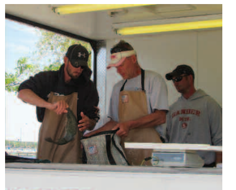
Representatives of both D and R Sports and BBT Bass weigh the fish for the tournament.