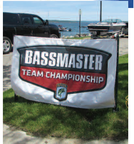
Bass fishermen from across the state took to Round Lake Saturday, June 6 for the first Bassmaster Tournament in Charlevoix.