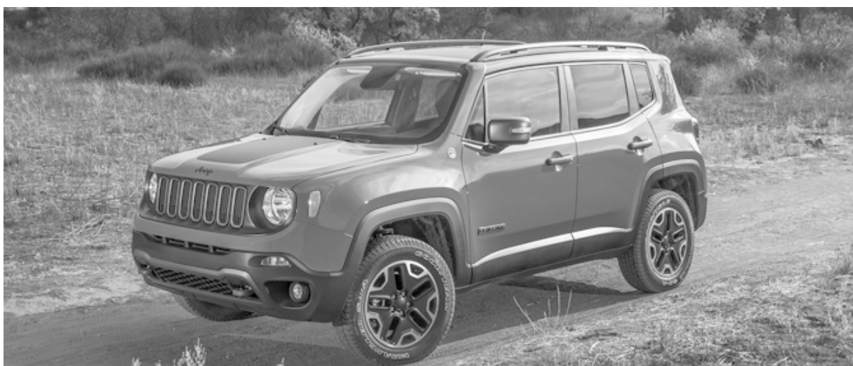
The all-new 2015 Jeep Renegade makes its debut on the "10 Coolest New Cars Under $18,000" list.