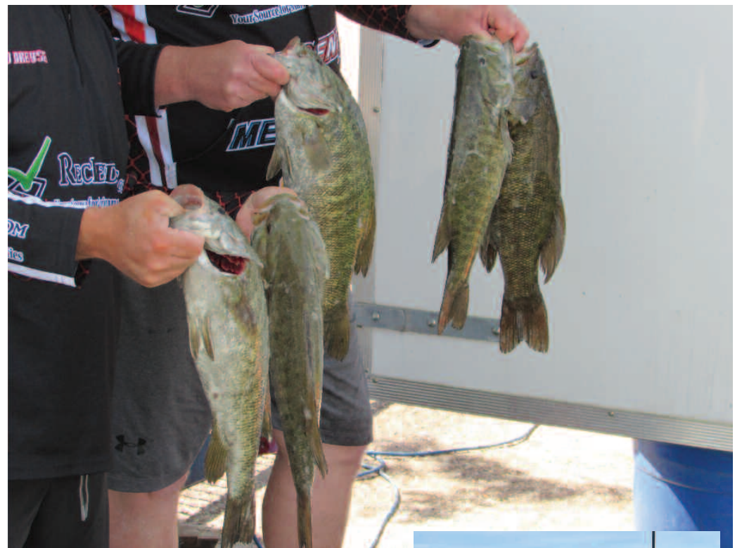
Fishermen display their catch after each weigh in.