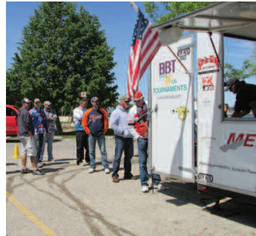
Over 75 participants wait in line to see whose catch will win.