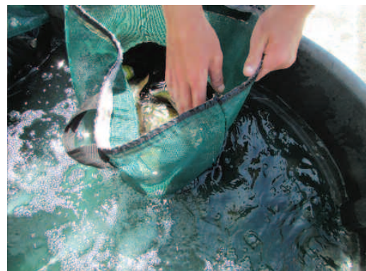
Fishermen hold their catch in water tanks before weighing in to see who caught the largest bass.