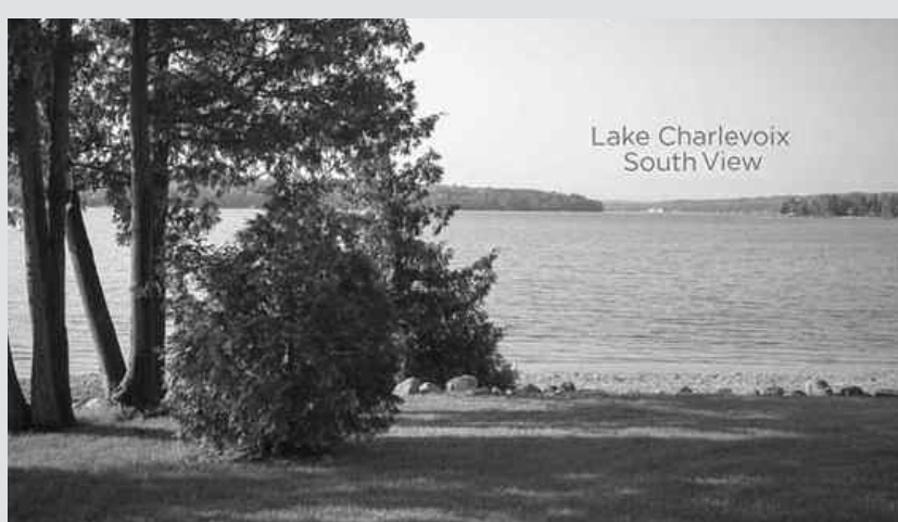
Lake Charlevoix South View